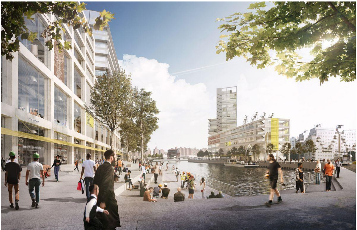
Master Plan rendering for a public waterfront esplanade at the project site.

The Yard's Master Plan lays out an ambitious vision for growth well beyond its current expansion. The master plan represents a potential $2.5 billion investment that would bring the total number of jobs at the Yard to 30,000. To achieve this growth, the Master Plan comprises the development of 5.1 million square feet of vertical manufacturing space, unlike any in the country, further solidifying the Yard's role as a national urban model for sustainable middle-class job creation. At the same time, the Master Plan outlines a series of open space and connectivity improvements aimed at integrating the 300-acre Yard with its surrounding neighborhoods, while improving operations for its manufacturing users. The rehabilitation of the Barge Basin site is a critical piece of the Yard's ambitious Master Plan allowing for future development.